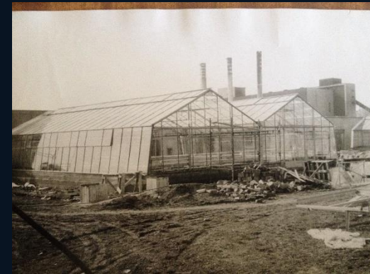
Pict.1,2 University and park Botanic garden